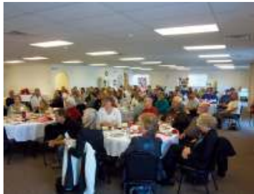
Great Participation from February's Luncheon Crowd