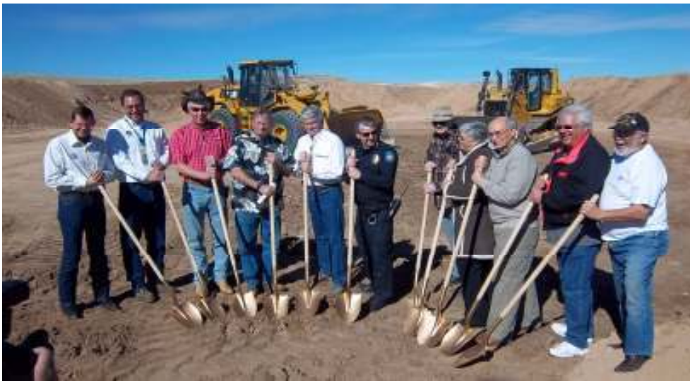
Ground breaking at the Chino Valley Shooting Facility