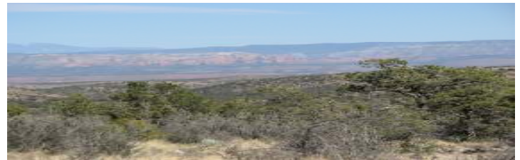
Panoramic Views from Every Angle