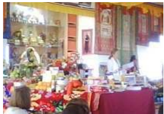
Colorful offerings in the Temple with Words of Wisdom and Humility