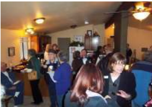
The Learning Center is Packed for the Mixer