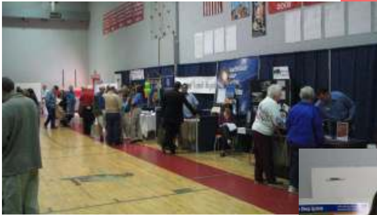
People visited vendors throughout the time of the Expo.