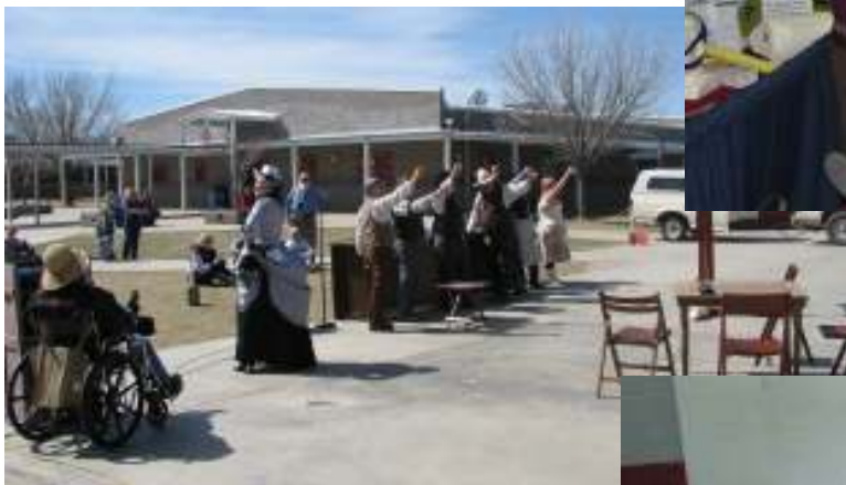
Boots & Bustles reenacts Arizona history.