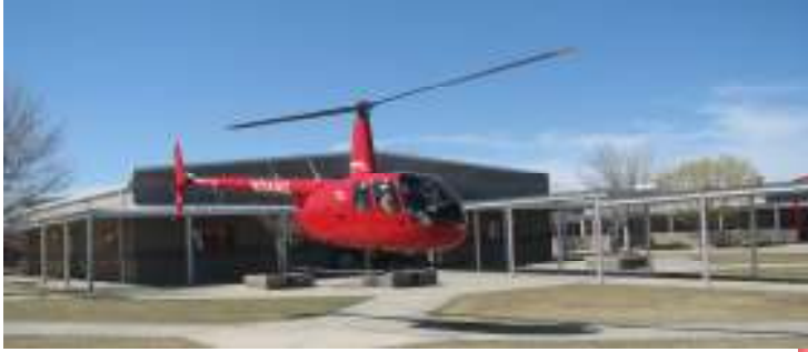
Guidance Helicopter landed and took off from Heritage Middle School.