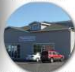
Stepping Stones Clothing Outlet 6717 E. 2nd Street Behind Red Barn location in PV