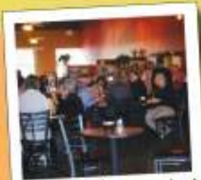
A fun environment at Step One Coffee House

Call Cori at 772.4184 to sign up or pick up an application at any location.