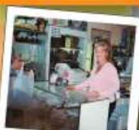
Greet thrift store shoppers with a smile!

2. We need your DONATIONS of clothing, linens, housewares, toys, furniture, books, electronics... you name it! When you SHOP with us, your money stays in THIS COMMUNITY and directly supports our emergency shelter for women and kids.