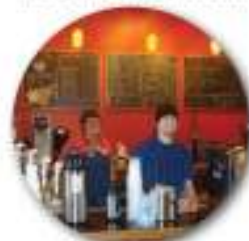
Step One Coffee House & Bookstore 6719 E. 2nd Street Behind Red Barn location in PV