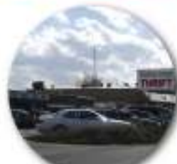
Stepping Stones Thrift 7465 E. 1st Street By Ace Hardware in PV

Your donations NEVER leave this community. STAY LOCAL, SELL LOCAL and SERVE LOCAL!