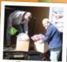
We'll pick up your large donations!

You can drop off at any location or call us at 759.0225 to arrange a PICK-UP of larger items.