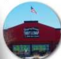
Stepping Stones Thrift Red Barn 6689 E. 1st Street Off Hwy 69 in PV