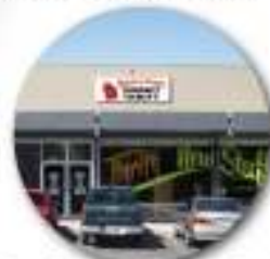
Stepping Stones Community Thrift 408 W Goodwin Street In downtown Prescott