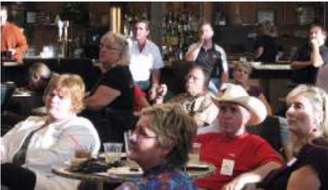
Some of the mixer attendees. It was a beautiful, Arizona sun day!