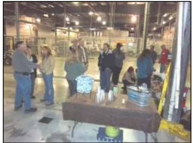
Mixer attendees with some of the C-Tech equipment in the background.